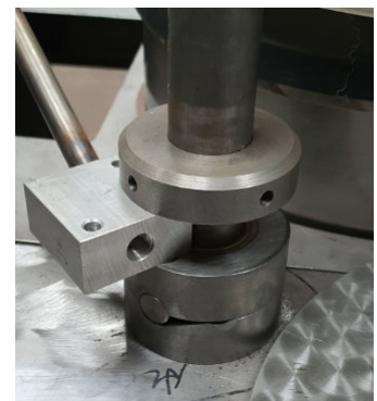
Figure 1 showing block used to lift the mixing chamber up