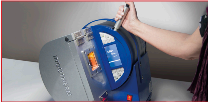
Pouring off is simple and easy, and takes place using a 90° rotation of the casting unit.