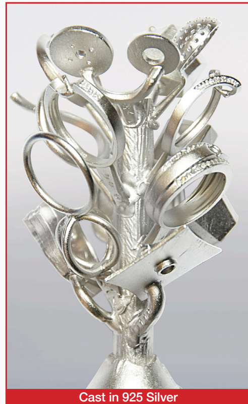
Cast in 925 Silver