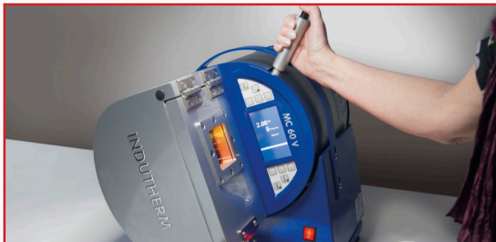
Pouring off is simple and easy, and takes place using a 90° rotation of the casting unit.