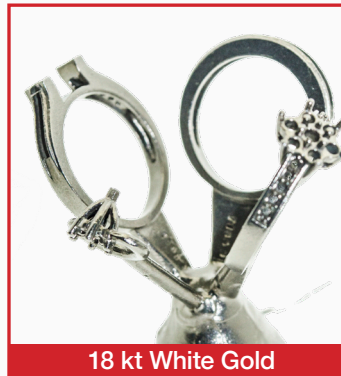
18 kt White Gold