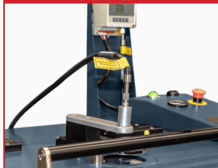
Optional Dual Spectrum Optical Pyrometer