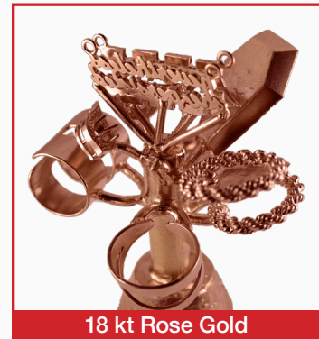
18 kt Rose Gold