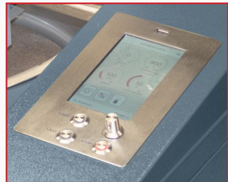
Touch Screen display for easy control of all functions